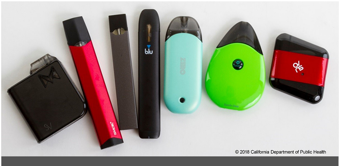
Image caption: Pod-based vaping devices do not look like other e-cigarettes. Many resemble flash drives or credit card holders, and are easier to hide than older models.