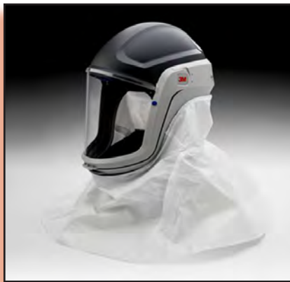
PAPR with helmet (APF=1000)