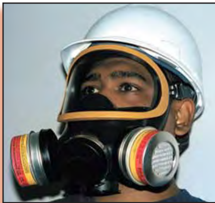
Full-face respirator (APF=50)