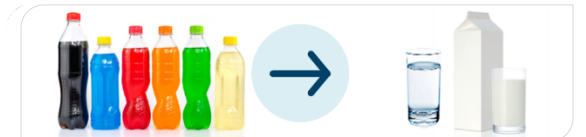
Beverages with Added Sugars