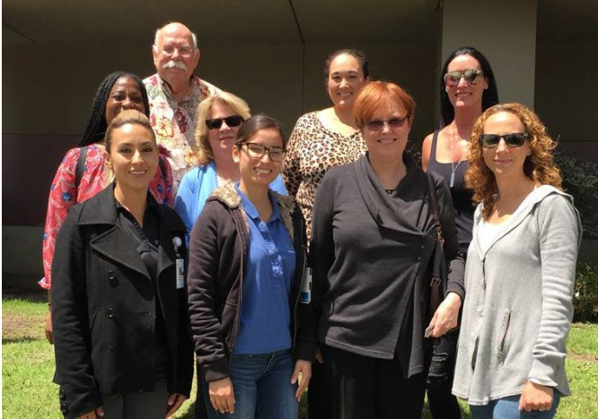
Southern California Regional SIDS Council.