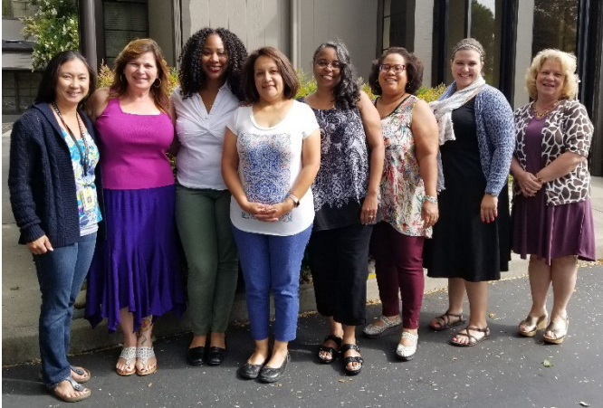
Northern California Regional SIDS Council

The Northern California Regional SIDS Council has not met since our last California SIDS Advisory Council meeting on July 23, 2019, so nothing new to report from the Northern Council. However, we are actively recruiting for nominations for President and Secretary. Elections will be held at our next meeting on November 20th, for a January 1, 2020, effective date.