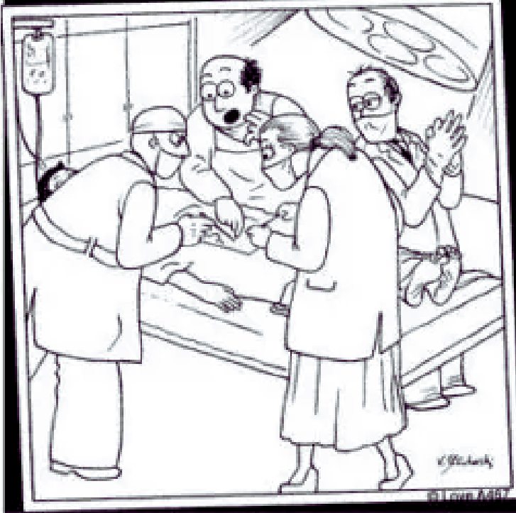
"Oh, here's the problem. He's got a doohickey on his thingamabob."