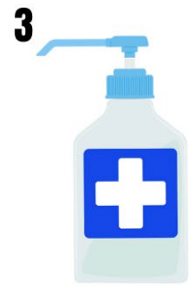
Alcohol-Based Hand Rub