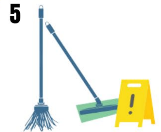
Mops & Wet Floor Sign